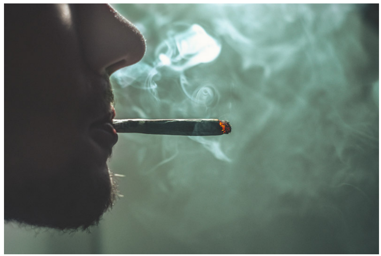
The answer has literally been right under our noses this whole time.

It is impossible to overstate how frustrating this is. These diseases, along with COVID-19, cause death and suffering on a magnitude that is hard to fathom. We have all the means to make real medical progress, but our scientists are hamstrung from taking the necessary steps to do so.