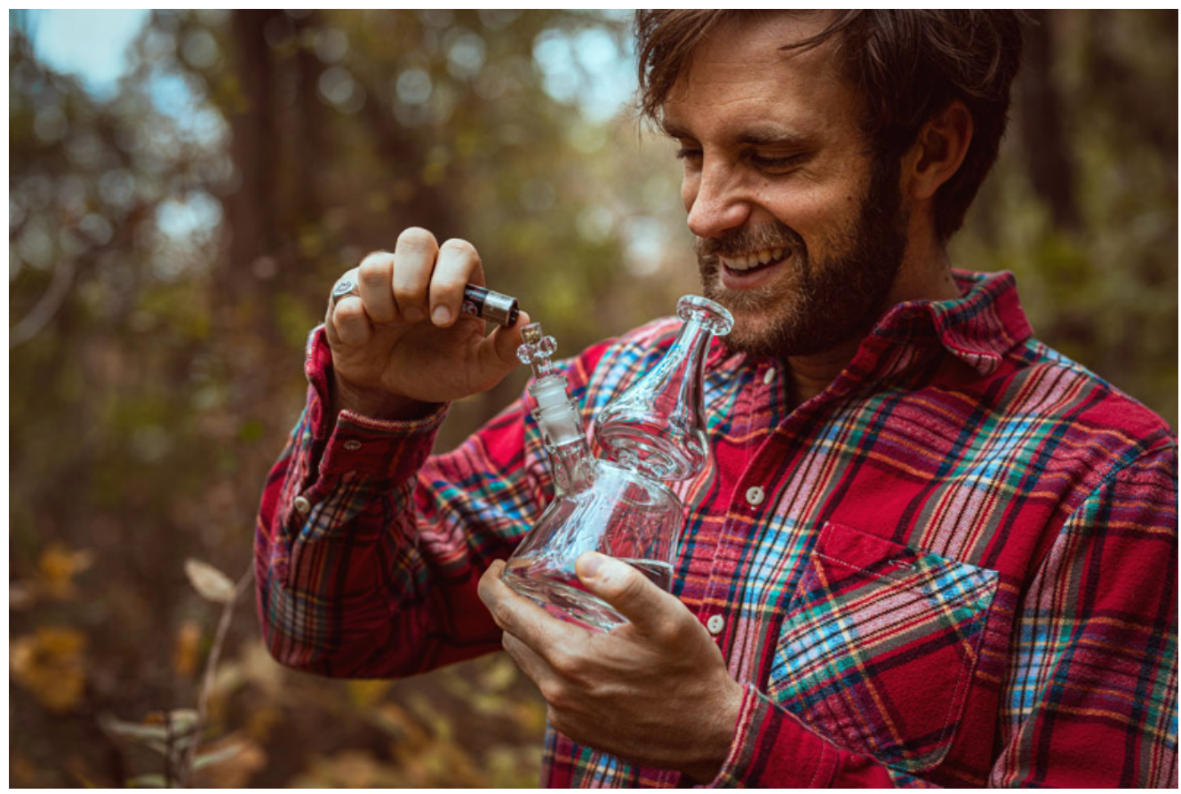
I mean they don't call it "getting low."

Marijuana has been rumored to make people feel good.