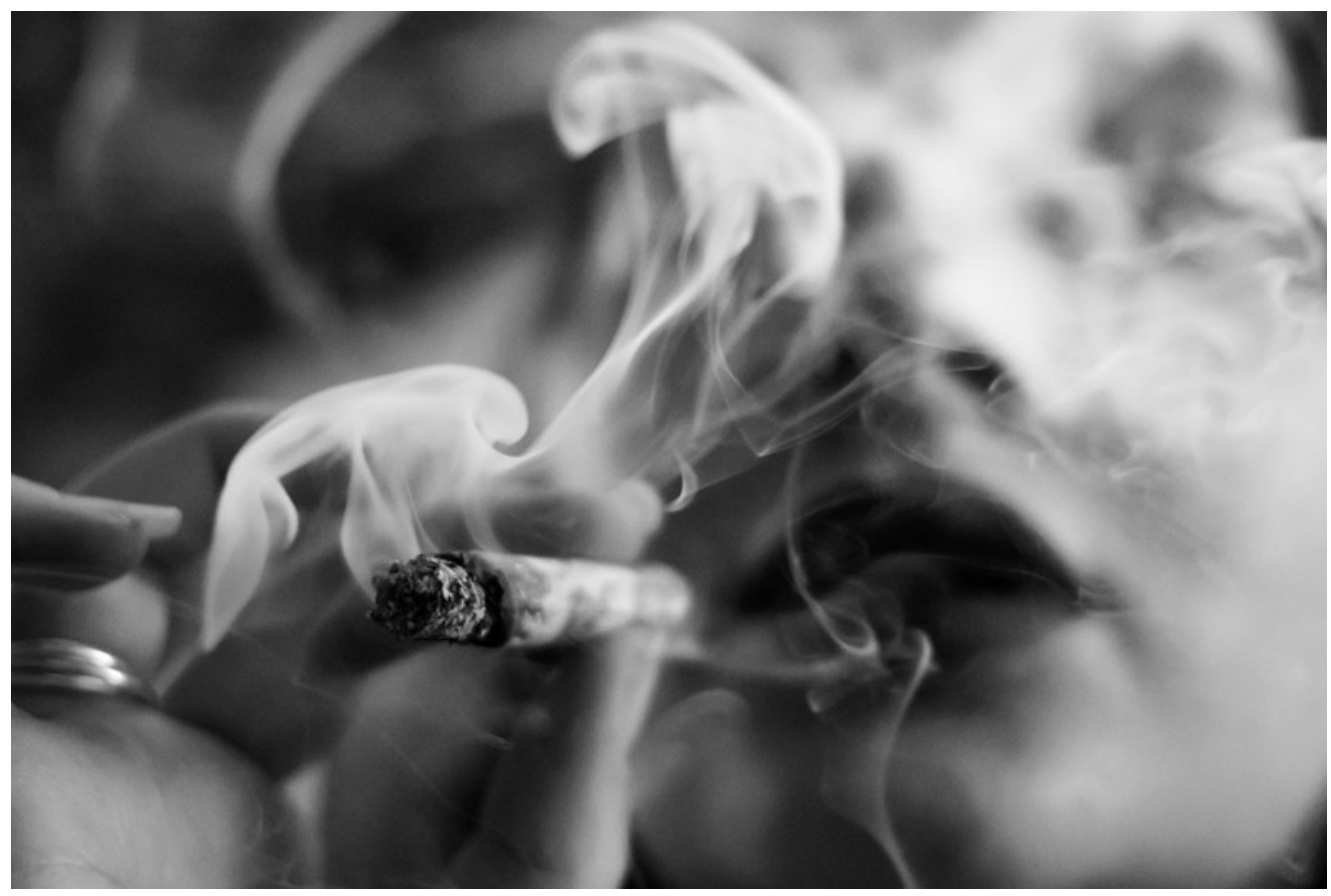
That said, don't not take your medicine.